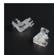
Connector for FPC and FPC CBBL205-DFTA-OXB

Refer Instruction Manual for detailed Installation Procedure