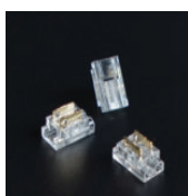
Connector for wire and FPC CXB205-DFTA - OXB