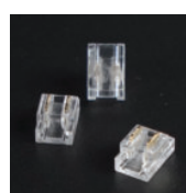
Connector for FPC and FPC CBB205-DFTA-OXB